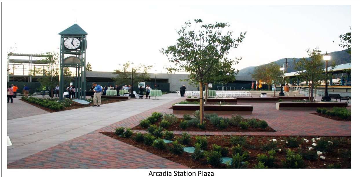
Arcadia Station Plaza

The Duarte/City of Hope Station is located on Duarte Road, just west of Highland Avenue, across the street from the City of Hope National Medical Center. “The Gold Line has provided the city the