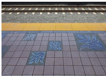
Pavers and Railing