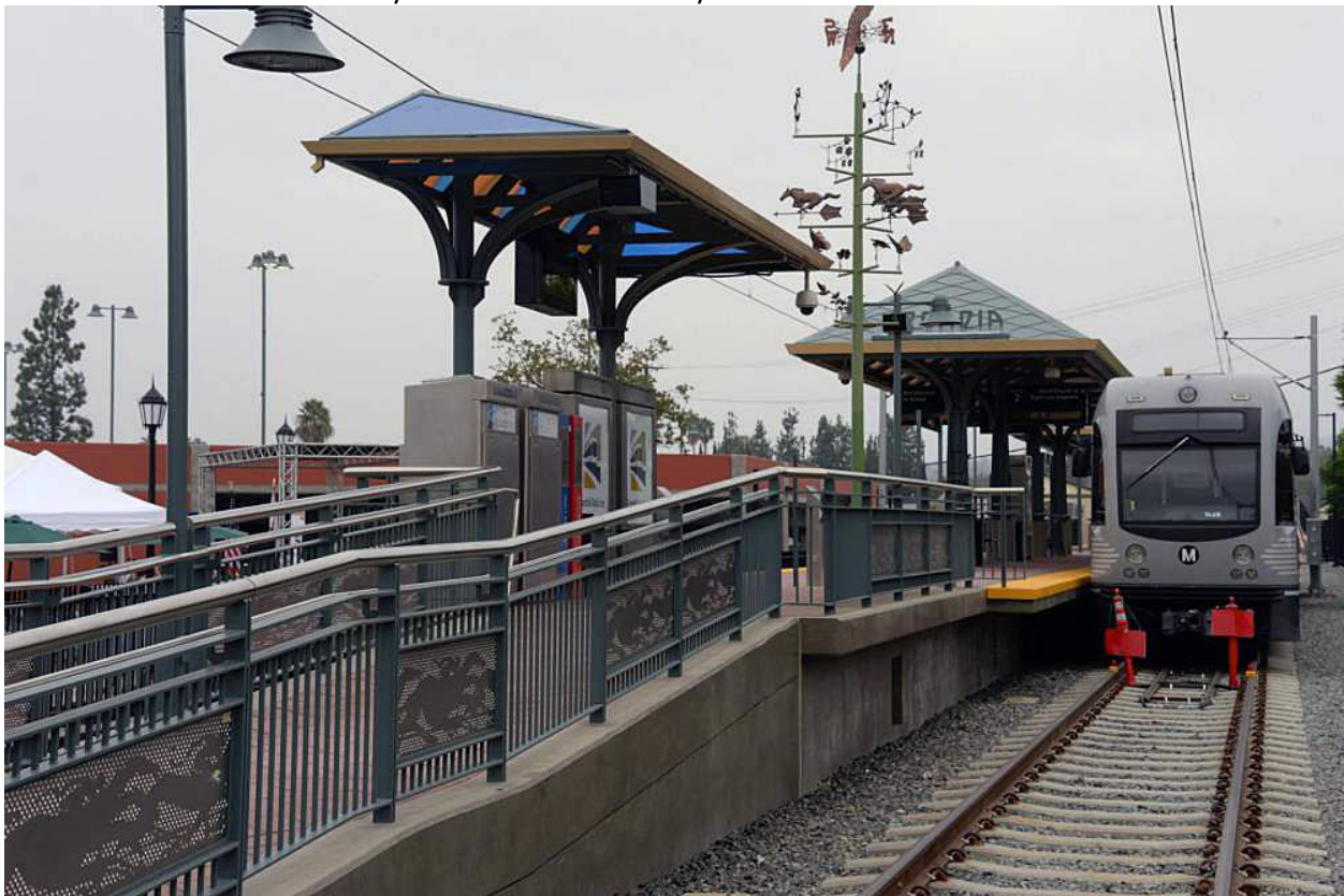
Arcadia Station: Located at the intersection of First Avenue and Santa Clara Street.