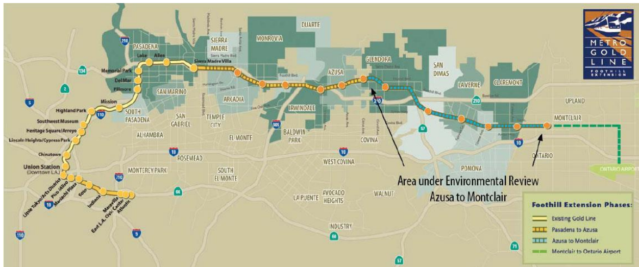
The Proposed Phase 2B – Azusa to Montclair