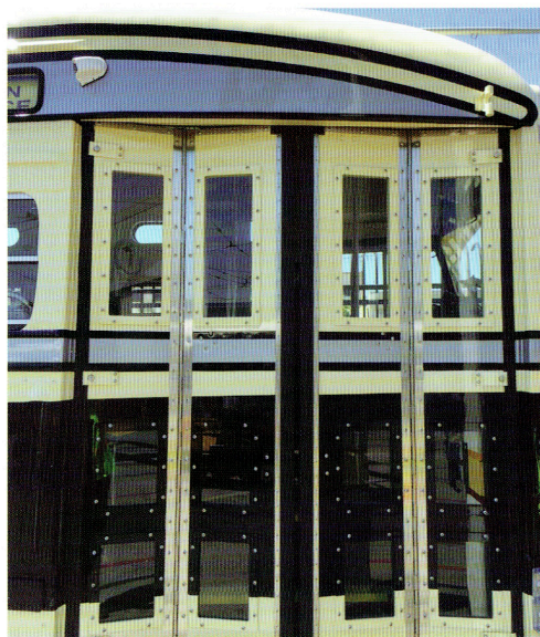
DOOR FRAMES —To achieve current fire resistance standards, the PCCs being rebuilt have metal frames around the windows and a ply-metal door construction. Note the right hand rear-view camera over the doors.