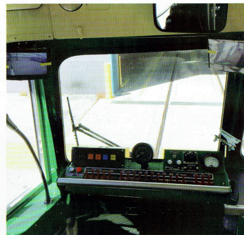
CENTRAL CONTROLS —The operator's console combines a traditional panel with such modern features as dual rear view cameras at the top of both sides of the windshield.

The transfer cutter is already a relic; after the contract was let, Muni announced it was discontinuing printed transfers.