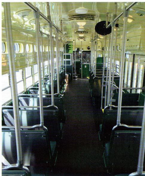
NEW CAR SMELL —Yep, the interior of 1056 smelled just like it came directly from the showroom.