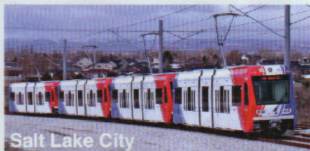
Salt Lake City

In 2010 Siemens introduced the latest edition of light rail vehicles, the 70% low floor Siemens S70 Ultra Short light rail vehicle. Each six-axle S70 Ultra Short light rail vehicle is equipped with two power trucks and a non-powered centre truck