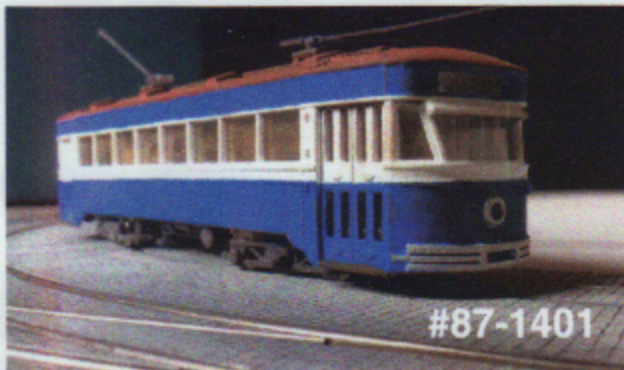
Scranton Railway shapeways* http://shpws.me/DBC1

In 1929, Scranton Railway Company began a modernization program with the purchase of ten "Electromobiles" built by the Osgood Bradley Car Company of Worcester, Massachusetts. These were the most modern streetcars available at that time.