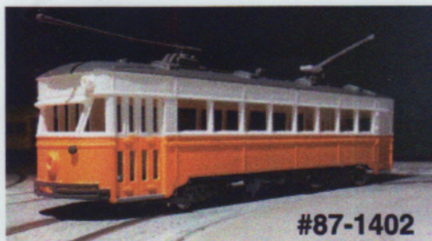
Altoona & Logan Valley Electric Railway shapeways* http://shpws.me/Edmn

Similar cars with slightly longer platforms were delivered new to New Bedford and sold later to the Queensborough Bridge Streetcar Line in New York.