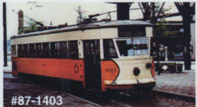
Queensborough Bridge Streetcar Coming soon ...